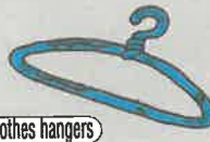
Metal clothes hangers