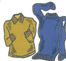
Heavily stained or torn clothing

If cinders are 5 cm or thicker, please do not dispose of them with burnable garbage.