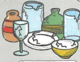
Crockery, dishes, etc.