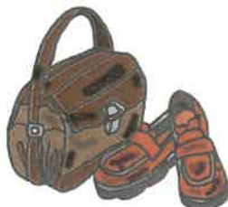
Leather products, sports shoes, etc.