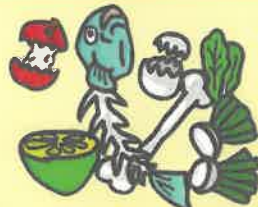
Kitchen (food) waste