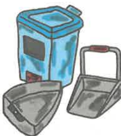
Plastics, vinyls, etc.

If cinders are 5 cm or thicker, please do not dispose of them with burnable garbage.