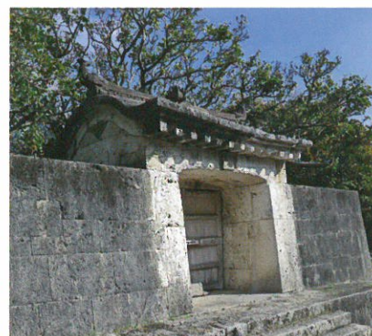
⑥ Sonohyan-utaki Ishimon Naha City