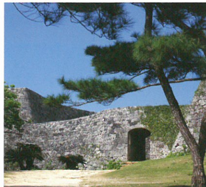
② Zakimi-jō site Yomitan Village