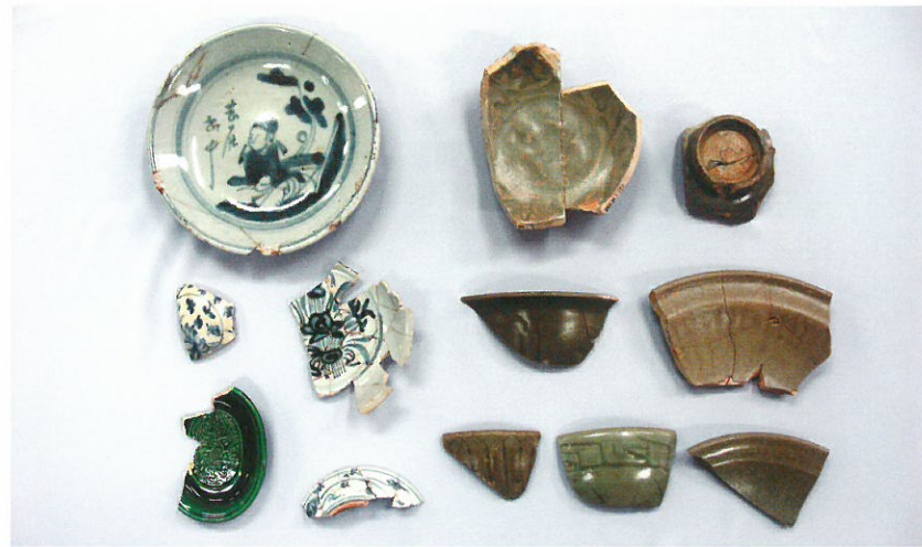
▲ Chinese porcelain