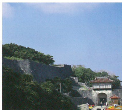
⑤ Shurijō site Naha City