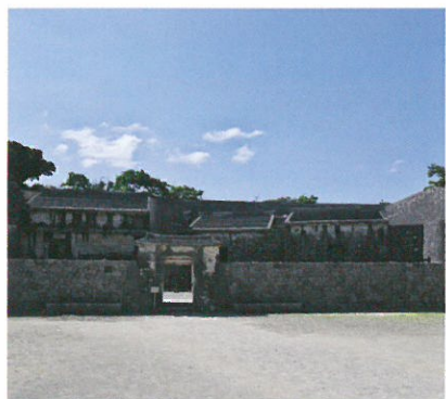
⑦ Tamaudun Naha City