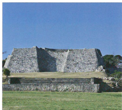
④ Nakagusuku-jō site Nakagusuku and Kitanakagusuku Villages