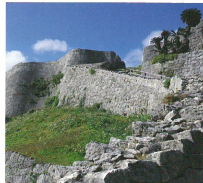
③ Katsuren-jō site Uruma City