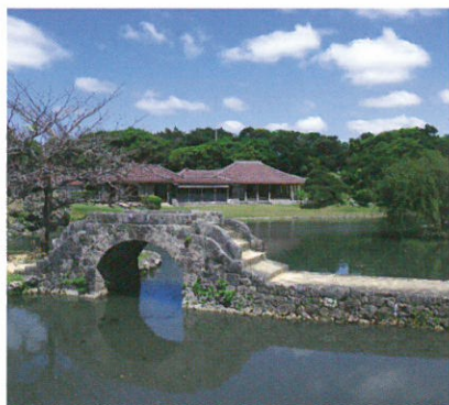
⑧ Shikinaen Naha City